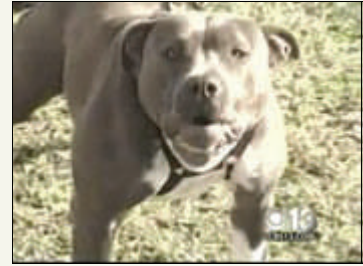
Baby the pit bull